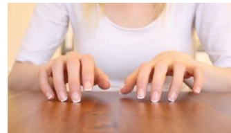
tapping with fingers