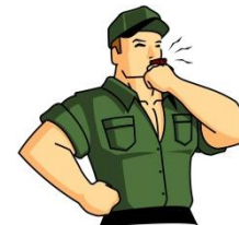
blowing a whistle